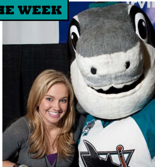
Tiffany Thornton of Disney's hit show Sonny With a Chance poses with FINZ during her autograph signing at Saturday's game vs. Hartford.